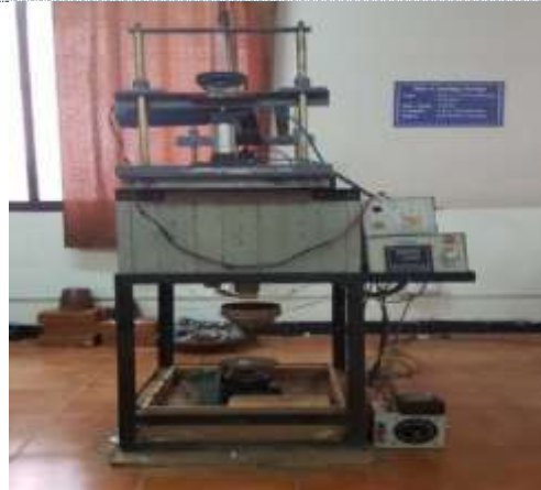
Fig. 1: Stir Casting Setup