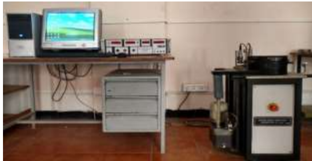
Fig. 2: Pin-on-disc Setup and Wear Monitor

By using rolling-sliding wear tester (tribometer), (shown in fig 2) wear behavior of materials was investigated. The apparatus consists of two discs (wheels) fixed to two parallel shafts pressed against each other under contact load.